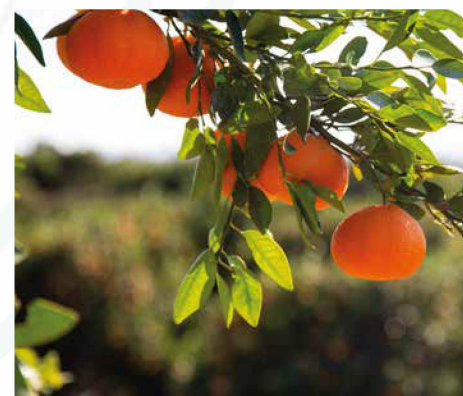
Results from an independent trial conducted in 2020 by Staphyt AUSTRALIA Ltd

Leading to reduced need for gassing of fruit, less picks, and lower labour requirements.